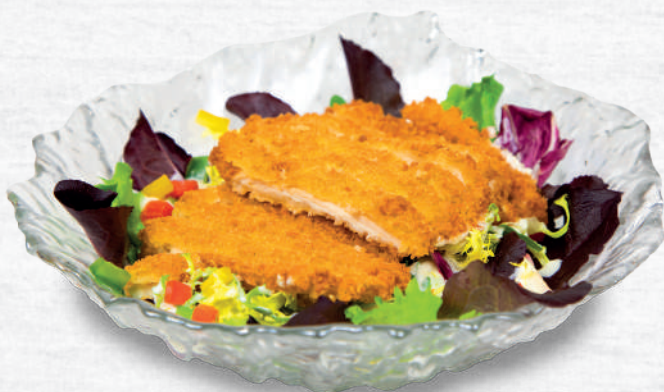
Katsu Chicken Salad