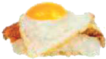
Quail and Eel Eggs 3,00 €