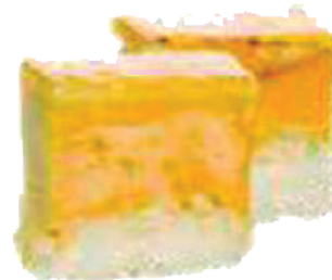
Oshi Sushi Foie gras micuit with apple and golden caramel coating (2/4 pieces). 4,50 € / 8,00 €