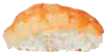
Wild Prawn 2,20 €