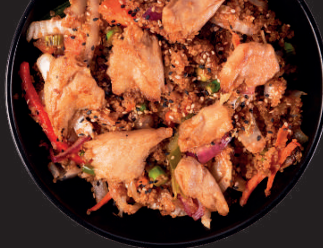
100% Vegetable Wok