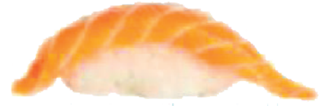
Norwegian Salmon 2,00 €