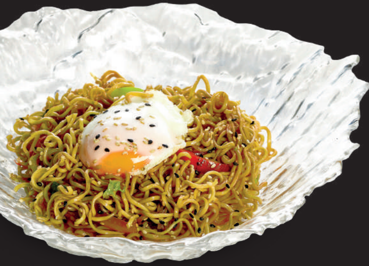
Vegetable Yakisoba with low-temperature egg