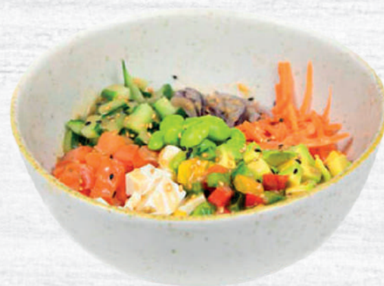
100% Vegetable Poke

Our salmon is of 100% Norwegian origin and of superior quality.