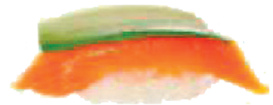
Salmon & Avocado 2,20 €