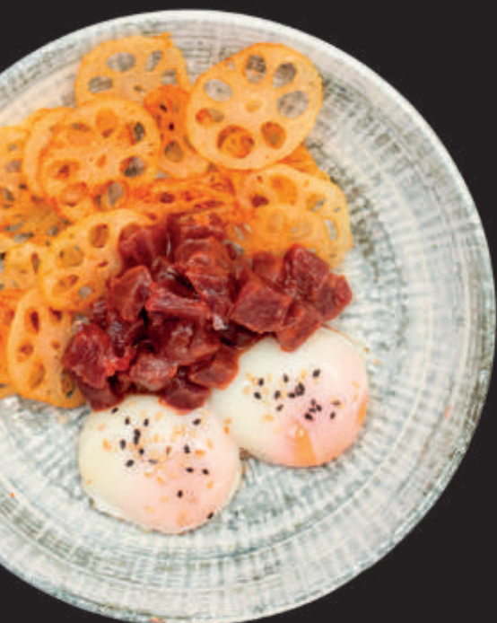
Bluefin Tuna Tartar with Eggs and Lotus Crisp

It is a vegetable protein that offers the experience of meat with all the benefits of vegetables..