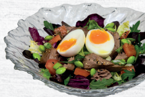
Red Tuna Salad with Almadraba Tuna confit