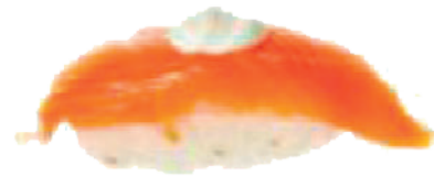
Salmon & Cream Cheese 2,20 €