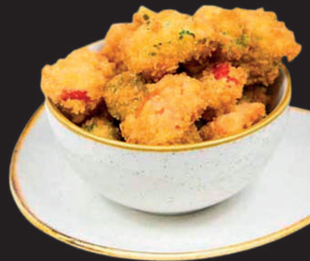
Panko Vegetable Tempura