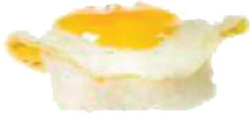
Quail egg with truffle 2,70 €