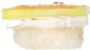
Brie flambéed with Truffle 2,50 €