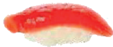
Bluefin tuna 2,80 €