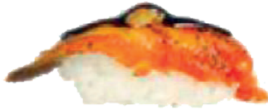
Eel and Foie Flambéed with teriyaki sauce. 3,20 €